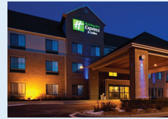
Holiday Inn Express Hotel & Suites 7887 94th Ave. Pleasant Prairie, WI 53158 262.942.6000

Travel with confidence and experience outstanding service for an easy and comfortable stay at an exceptional value. Guests will enjoy complimentary hot breakfast, complimentary Wi-Fi throughout the hotel, and our pool and fitness center will help you stay on track. Located just minutes from the Pleasant Prairie RecPlex, you'll always find the courteous service you deserve, plus all the little things you expect from Fairfield.