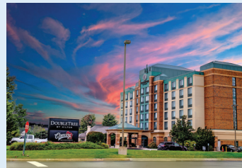
DoubleTree by Hilton 11800 108th St. Pleasant Prairie, WI 53158 262.857.3377

Explore the area, attend your meeting, win that competition, but at the end of your adventure - relax.