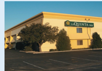
La Quinta Inn by Wyndham 7540 118th Ave. Pleasant Prairie, WI 53158 262.857.7911

Only one mile East of I-94 off of Hwy. 50, guests will enjoy a complimentary hot breakfast and Express Start Breakfast Bar, heated indoor pool, whirlpool, 24-hour business center, fitness center, and free high-speed WiFi throughout the hotel. Whether you're in the area to explore attractions such as Jelly Belly, the Premium Outlets, the Pleasant Prairie RecPlex, or you're here on business, stay smart, stay refreshed, stay express with us!