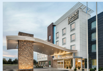
Fairfield Inn & Suites by Marriott 10601 120th Ave. Pleasant Prairie, WI 53158 262.455.7795

The only full-service Hilton in the area, the DoubleTree by Hilton is located just off of I-94 and HWY 165. As a welcomed guest, you will enjoy great amenities including complimentary WiFi, a heated indoor pool and whirlpool, on-site dining or room service at The Chancery Bar and Grill, a business center, and 24-hour fitness center. Also, enjoy complimentary shuttle service within five miles of the hotel.