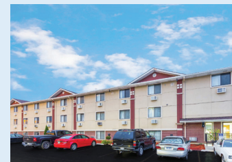
Super 8 by Wyndham 7601 118th Ave. Pleasant Prairie, WI 53158 262.857.7963

Conveniently located just off of I-94 and Hwy 50, our pet-friendly hotel is situated within minutes of the Premium Outlets, the Pleasant Prairie RecPlex, and Jelly Belly. Stay the night and you'll enjoy a free Bright Side Breakfast, with waffles, fresh fruit, yogurt, hard-boiled eggs, assorted pastries and more. Our friendly staff will help you with anything day or night. We offer free local calls, free Wi-Fi, premium cable, pay-per-view movies, and video games.