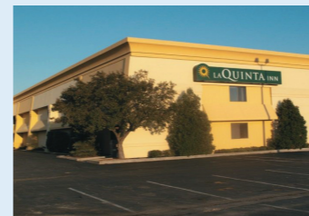
La Quinta Inn by Wyndham 7540 118th Ave. Pleasant Prairie, WI 53158 262.857.7911

Only one mile East of I-94 off of Hwy. 50, guests will enjoy a complimentary hot breakfast and Express Start Breakfast Bar, heated indoor pool, whirlpool, 24-hour business center, fitness center, and free high-speed WiFi throughout the hotel. Whether you're in the area to explore attractions such as Jelly Belly, the Premium Outlets, the Pleasant Prairie RecPlex, or you're here on business, stay smart, stay refreshed, stay express with us!