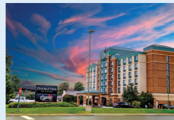
DoubleTree by Hilton 11800 108th St. Pleasant Prairie, WI 53158 262.857.3377

The only full-service Hilton in the area, the DoubleTree by Hilton is located just off of I-94 and HWY 165. As a welcomed guest, you will enjoy great amenities including complimentary WiFi, a heated indoor pool and whirlpool, on-site dining or room service at The Chancery Bar and Grill, a business center, and 24-hour fitness center. Also, enjoy complimentary shuttle service within five miles of the hotel.