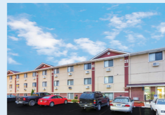
Super 8 by Wyndham 7601 118th Ave. Pleasant Prairie, WI 53158 262.857.7963

Conveniently located just off of I-94 and Hwy 50, our pet-friendly hotel is situated within minutes of the Premium Outlets, the Pleasant Prairie RecPlex, and Jelly Belly. Stay the night and you'll enjoy a free Bright Side Breakfast, with waffles, fresh fruit, yogurt, hard-boiled eggs, assorted pastries and more. Our friendly staff will help you with anything day or night. We offer free local calls, free Wi-Fi, premium cable, pay-per-view movies, and video games.