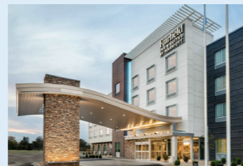
Fairfield Inn & Suites by Marriott 10601 120th Ave. Pleasant Prairie, WI 53158 262.455.7795

The only full-service Hilton in the area, the DoubleTree by Hilton is located just off of I-94 and HWY 165. As a welcomed guest, you will enjoy great amenities including complimentary WiFi, a heated indoor pool and whirlpool, on-site dining or room service at The Chancery Bar and Grill, a business center, and 24-hour fitness center. Also, enjoy complimentary shuttle service within five miles of the hotel.