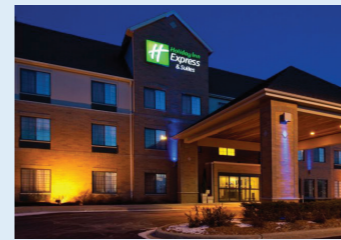
Holiday Inn Express Hotel & Suites 7887 94th Ave. Pleasant Prairie, WI 53158 262.942.6000

Travel with confidence and experience outstanding service for an easy and comfortable stay at an exceptional value. Guests will enjoy complimentary hot breakfast, complimentary Wi-Fi throughout the hotel, and our pool and fitness center will help you stay on track. Located just minutes from the Pleasant Prairie RecPlex, you'll always find the courteous service you deserve, plus all the little things you expect from Fairfield.