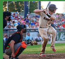
Northwoods Baseball League