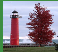
Lake Michigan Adventures