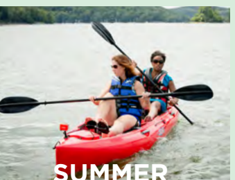
Water Sports • Waterparks