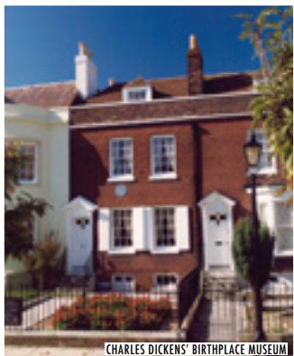
CHARLES DICKENS' BIRTHPLACE MUSEUM