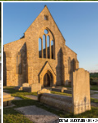
ROYAL GARRISON CHURCH