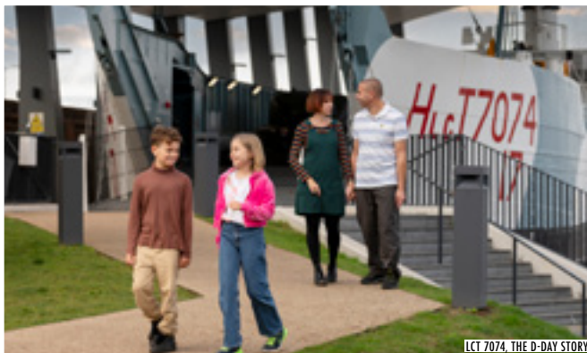
LCT 7074, THE D-DAY STORY