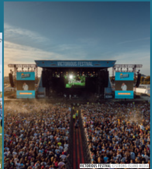
VICTORIOUS FESTIVAL