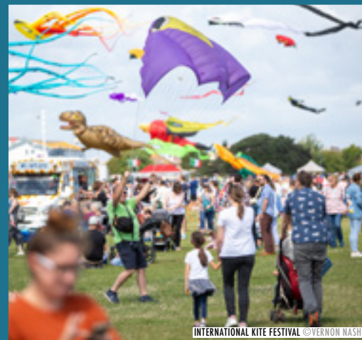
INTERNATIONAL KITE FESTIVAL