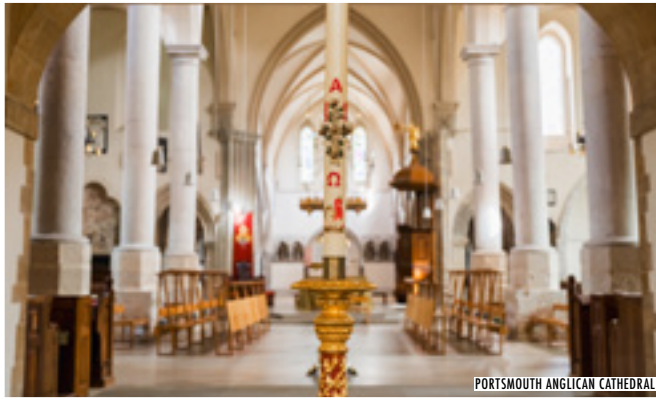
PORTSMOUTH ANGLICAN CATHEDRAL