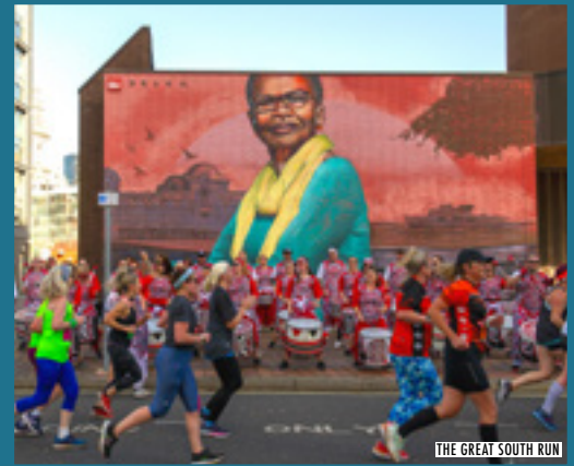
THE GREAT SOUTH RUN

In 2026 the city is celebrating its centenary and more events than ever are planned as part of Portsmouth100 including a series of concerts in spring and summer and The Pride of Portsmouth Lion Art Trail. In addition, the city welcomes back Comic Con, Sail GP, the end of Clipper Round the World Race, Victorious Festival and the Great South Run. For the most up to date information on all events go to visitportsmouth.co.uk