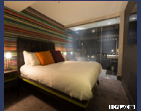
THE VILLAGE INN

The team are keen to help arrange familiarisation visits for group organisers to visit the city and help with planning for a future visit. Get in touch to find out more.