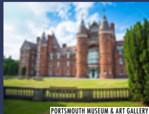
PORTSMOUTH MUSEUM & ART GALLERY