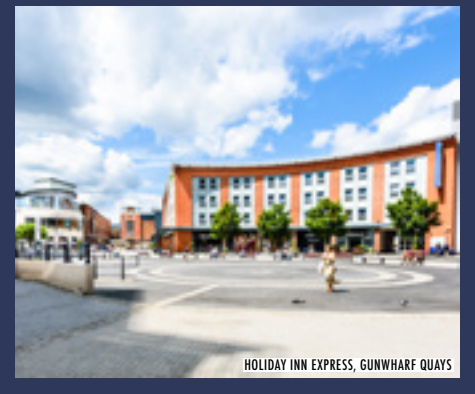
HOLIDAY INN EXPRESS, GUNWHARF QUAYS

For details on these and more group accommodation offers go to visitportsmouth.co.uk/accommodation