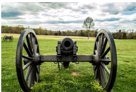
Manassas National Battlefield Park