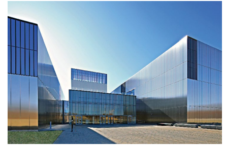
National Museum of the United States Army

The National Museum of the United States Army shines a unique light on the symbiotic relationship between the Army and society, highlighting the Army's direct influence on our nation socially, technologically, scientifically, financially, and culturally. The Museum immerses visitors in 245 years of American Soldiers' experiences. With its various galleries, 300+ degree multi-sensory theater, fully interactive Experiential Learning Center, cutting edge simulation and virtual reality experiences, shopping, and gourmet café, this incredible destination is exciting for guests of all interests and ages.