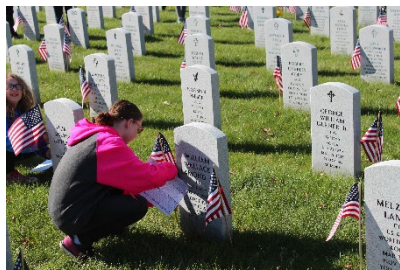
National Memorial Cemetery at Quantico

Your next stop is the National Memorial Cemetery at Quantico where you will pay your respects with a private flag placing experience at the graves of veterans whose remains were previously forgotten. Hosted by the Missing in America Project, their mission is to find, identify and provide full military burial for these now remembered heroes.