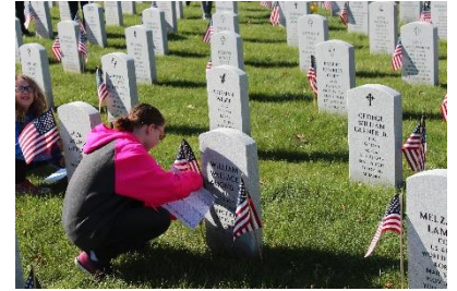
Quantico National Cemetery

Start your tour by paying your respects at Quantico National Cemetery with a private flag placing experience at the graves of veterans whose remains were previously forgotten. Hosted by the Missing in America Project, their mission is to find, identify and provide full military burial for these now remembered heroes.