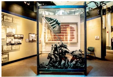
National Museum of the Marine Corps

Your next stop is an experience at the National Museum of the Marine Corps . Uncover the history of the Corps, test your skills as a Marine, and get insight into the lives of those who fight for our freedom. During your visit, see the incredible Gene Hackman-narrated film “We, The Marines” to get an unparalleled view into the experiences of Marines from boot camp through modern warfare training. Enjoy lunch at Devil Dog Diner , a cafeteria-style eatery, or Tun Tavern , a replica of the Philadelphia tavern where the Marine Corps was established.