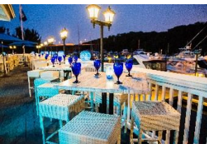
The Harbour Grille

The history will continue with dinner at The Harbour Grille , settled along the Occoquan River. While enjoying the view of the marina, sample from menu items such as the Angus Ribeye Steak or Grilled Atlantic Salmon with Crispy Parmesan Polenta. Nothing like enjoying surf and turf along the water to top off a perfect day!