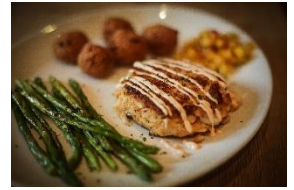
Out of the Blue

To top off the day, kick up your feet and relax for dinner. The experience will be brought right to your table with dinner at Out of the Blue . You will feel like the boat just pulled in with how fresh the seafood is arriving at your table. They hand select their crabs, including their enormous colossal blue crabs, by the former commercial fisherman and owner. They even have a custom designed steaming system so your fresh catch is cooked with tender care.