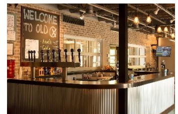
Old Ox Brewery

One of more than 30 breweries along the LoCo Ale Trail, Old Ox Brewery is the place to go and hang out with friends. Named for one of the oldest roads in Loudoun County that originally connected the agricultural producers of Loudoun to the markets in Fairfax County and beyond. Yet another way to bring the farm to table. Enjoy a tasting and tour at Old Ox Brewery.