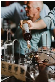
MurLarkey Distilled Spirits

Finish out your culinary adventure with a knockout tour at MurLarkey Distilled Spirits . If there are two things the team at MurLarkey knows, it is spirits and quality customer experiences. Unaged and aged distilled spirits are made, stored, bottled, and shipped right on site. Walk around the plant for an in-depth tour on the production process of spirits and have a tasting too!