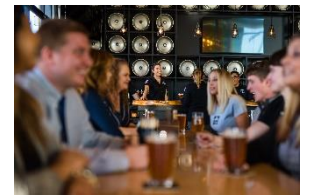
2 Silos Brewing

Your next food stop will take place at 2 Silos Brewing Company . The newest destination brewery in the region, this expansive property repurposed a historic barn with two silos attached (get it?!) which are the focal point of this impressive brewery and live music venue. Between the 10,000 square foot beer garden, bocce courts, multiple bars, and an impressive farm-to-table inspired menu, you may not want to leave!