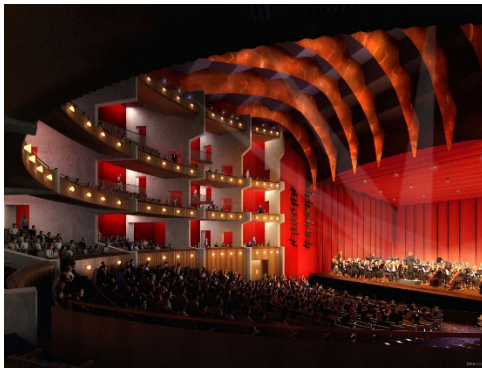
Hylton Performing Arts Center

Looking for a thrilling activity that is also educational? Look no further than K1 Speedway where you will experience an indoor go-kart race with speeds up to 50 mph. Their safety precautions include a four-point harness and superior braking system that will ensure a great environment to put the pedal to the metal! Student groups can also participate in their classroom-based, STEAM focused, education programs to enhance their experience. Enjoy lunch at Uptown Alley , immediately next door, or at the food court at Manassas Mall.