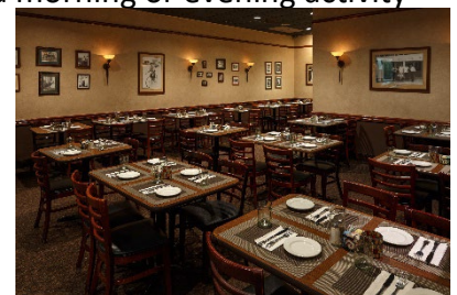
Giorgio’s Family Restaurant

Dinner tonight is at Giorgio’s Family Restaurant for a tasty Italian dinner! If you are looking for something different, consider these other options: EpiQ Food Hall for a variety of choices, Fuddruckers for a crowd-pleasing sandwich, or Padrino’s for a plethora of Italian favorites.