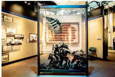
National Museum of the Marine Corps

Start your tour at the National Museum of the Marine Corps . Uncover the history of the Corps, test your skills as a Marine, and get insight into the lives of those who fight for our freedom. During your visit, see the incredible Gene Hackman-narrated film “We, The Marines” to get an unparalleled view into the experiences of Marines from boot camp through modern warfare training. Also included in your visit is a hands-on activity centered around the STEAM skills modern-day Marines need to keep our country safe.