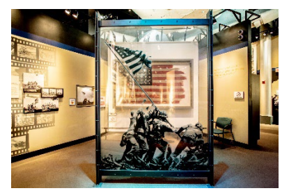
National Museum of the Marine Corps

The call of the holiday season brings on thoughts of twinkling lights, cups of eggnog or hot cocoa, and the glowing feeling of appreciation for everything we have. This tour combines unique experiences with memorable moments to get you excited for the holidays. See beautifully decorated historic homes, breathtaking museums, and quaint shops to fill your heart with excitement as the holidays approach.