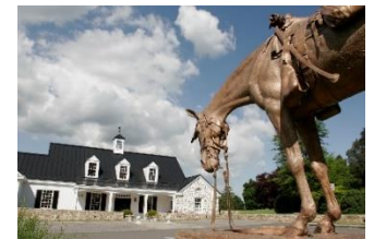
National Sporting Library and Museum

Make your way to Middleburg, the Horse and Hunt Capital of the Country and visit The National Sporting Library and Museum . This hidden gem located in Middleburg, Virginia has a deceiving name. Take a docent-led tour through the art museum where the pieces come alive from the stories and make sure to visit the rare book room with books as far back as the 1500's and unique pieces from President Roosevelt. Be sure to ask a librarian what a fore-edge book is!