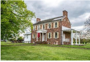
Ben Lomond Historic Site

Manassas was an especially important spot during one of America's most influential moments: The Civil War. You will begin your day at Ben Lomond Historic Site , a hospital used during the First Battle of Manassas. As you explore the home, a tour guide will provide narration on what it was like to be a patient in 1861. You will be fully immersed in the experience as you will hear, smell, feel, and even taste the history. One of the oldest ways to make food, an open-hearth cooking demonstration, will also be on-site.