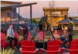
2 Silos Brewing

Next, hop by 2 Silos Brewing Company to taste of some of the local beers and ales. This brewery is a destination brewery featuring live music and from-scratch food. The brewery got its name from the former grain barn with its two iconic silos.