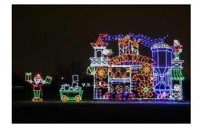
Bull Run Festival of Lights

Lights . Transport yourself back to your childhood, glaring in awe out the window, and enjoy the magical glow of the twinkling lights overhead. If you want to stretch your legs, stop at the Holiday Village to pick up some tasty treats, take your picture with Santa, and warm up by the fire pits.