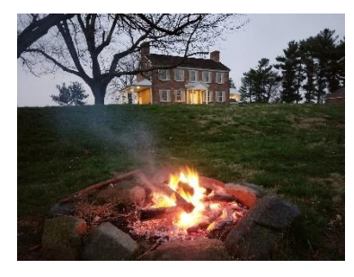
Ben Lomond Historic Site

The sound of wood crackling on an outdoor campfire is a wonderful holiday experience. Add in s'mores and warm apple cider and you're ready for the holidays at Ben Lomond Historic Site . Enjoy a guided tour of this 18<sup>th</sup> century home, once used as a field hospital during the Civil War.