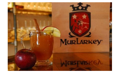
MurLarkey Distilled Spirits

Distilled Spirits for a holiday season cocktail tasting and tour. Unaged and aged distilled spirits are made, stored, bottled, and shipped right on site. Their resident mixologists will show you how to make some holiday favorites to spice up your next get together, family event, or relaxing night at home.