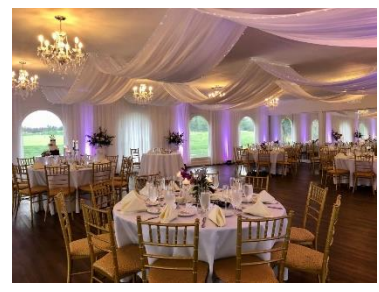
Bristow Manor Golf Club

Next, enjoy a holiday themed lunch at Bristow Manor Golf Club , while carolers or musicians entertain you with songs of the season. This colonial revival manor home was built in the 1800's and provides an impeccable view of the rolling countryside and adjacent golf course.