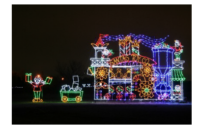
Bull Run Festival of Lights

Lights . Transport yourself back to your childhood, glaring in awe out the window, and enjoy the magical glow of the twinkling lights overhead. If you want to stretch your legs, stop at the Holiday Village to pick up some tasty treats, take your picture with Santa, and warm up by the fire pits.