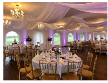
Bristow Manor Golf Club

Next, enjoy a holiday-themed lunch at Bristow Manor Golf Club , while carolers or musicians entertain you with songs of the season. This colonial revival manor home was built in the 1800's and provides an impeccable view of the rolling countryside and adjacent golf course.