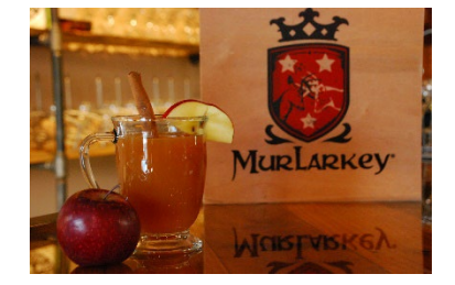
MurLarkey Distilled Spirits

Distilled Spirits for a holiday season cocktail tasting and tour . Unaged and aged distilled spirits are made, stored, bottled, and shipped right on-site. Their resident mixologists will show you how to make some holiday favorites to spice up your next get-together, family event, or relaxing night at home.