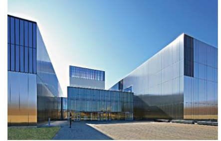
National Museum of the United States Army

The National Museum of the United States Army shines a unique light on the symbiotic relationship between Army and society, highlighting the Army's direct influence on our nation socially, technologically, scientifically, financially, and culturally. The Museum immerses visitors in 245 years of American Soldiers' experiences. With its various galleries, 300+ degree multi-sensory theater, fully interactive Experiential Learning Center, cutting edge simulation and virtual reality experiences, shopping, and gourmet café, this incredible destination is exciting for guests of all interests and ages.