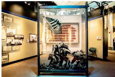
National Museum of the Marine Corps

Your next stop is an experience at the National Museum of the Marine Corps . Uncover the history of the Corps, test your skills as a Marine, and get insight into the lives of those who fight for our freedom. During your visit, see the incredible Gene Hackman-narrated film "We, The Marines" to get an unparalleled view into the experiences of Marines from boot camp through modern warfare training.