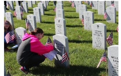
Quantico National Cemetery

After lunch, pay your respects at Quantico National Cemetery with a private flag placing experience at the graves of veterans whose remains were previously forgotten. Hosted by the Missing in America Project, their mission is to find, identify and provide full military burial for these now remembered heroes.