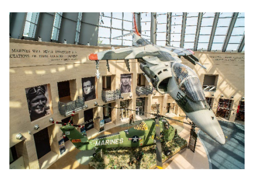
National Museum of the Marine Corps

Start your day by joining the National Museum of the Marine Corps for a cake-cutting ceremony to celebrate the Marine Corps' birthday. Held at 10:00am and 2:00pm, the traditional passing of cake from the oldest to the youngest Marine demonstrates the passing of the honor, experience, and heart of the Corps to the next generation of Marines to carry on. During your visit, enjoy a delicious lunch at Devil Dog Diner , a cafeteria-style eatery, or Tun Tavern , a replica of the Philadelphia tavern where the Marine Corps was established.