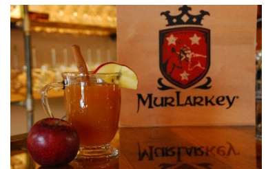
MurLarkey Distilled Spirits

How did most soldiers get through these harrowing times? By drinking whiskey! Your next stop is at MurLarkey Distilled Spirits , a craft spirits company founded by second-generation Irish American cousins. Your experience will not be simply tasting their spirits but a bartending lesson as their team creates miniature craft cocktails so you can get a real-world sense of how to serve their spirits at home.