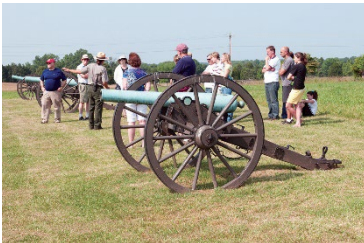
Manassas National Battlefield

Begin your summer retreat with a refreshing lunch at one of the many restaurants within a mile of Manassas National Battlefield. Choose from the numerous nationally recognized restaurants, as well as local options, so you’re close to the action for your next stop on the tour. Did you know the residents of Washington D.C., in July 1861, loaded their horses and carriages full of supplies for the 25-mile jaunt to what is now Manassas National Battlefield for a picnic? These naive citizens watched one of the most seminal moments in American history from a hill not too far from where the battle began.