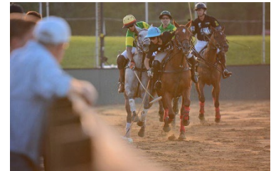
Polo at Morven Park

Get dressed to the nines or wear a comfy pair of jeans for Polo in the Park . Bring a chair or a picnic blanket and enjoy a night of Polo. Enjoy a boxed dinner while sipping and enjoying the fast-paced matches on a nice summer evening.