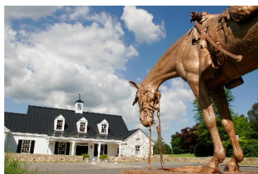
National Sporting Library

Start your morning at the National Sporting Library and Museum . Horsemanship, steeplechasing, foxhunting, polo, coaching, and more come to life with a docent-led tour through this unique museum. A visit to the rare book room will showcase some of the items that make this museum such a hidden gem in Loudoun County.