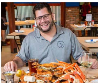
Out of the Blue

After a day of history and liquid encouragement, settle down for a delectable meal at Out of the Blue Crabs and Seafood , a family-owned modern fish house. One of the owners catches a majority of their seafood himself!