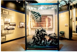
National Museum of the Marine Corps

Your next stop is an experience at the National Museum of the Marine Corps . Uncover the history of the Corps, test your skills as a Marine, and get insight into the lives of those who fight for our freedom. During your visit, see the incredible Gene Hackman-narrated film “We, The Marines” to get an unparalleled view into the experiences of Marines from boot camp through modern warfare training. Enjoy a quick lunch in the Devil Dog Diner, their cafeteria-style eatery, or Tun Tavern, a recreation of the famous tavern in which the Marines were founded in Philadelphia on November 10, 1775.