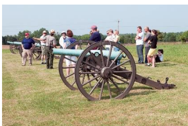
Manassas National Battlefield

Begin your summer retreat with a refreshing lunch at one of the many restaurants within a mile of Manassas National Battlefield. Choose from the numerous nationally recognized restaurants, as well as local options, so you’re close to the action for your next stop on the tour. Did you know the residents of Washington D.C., in July 1861, loaded their horses and carriages full of supplies for the 25-mile jaunt to what is now Manassas National Battlefield for a picnic? These naive citizens watched one of the most seminal moments in American history from a hill not too far from where the battle began.