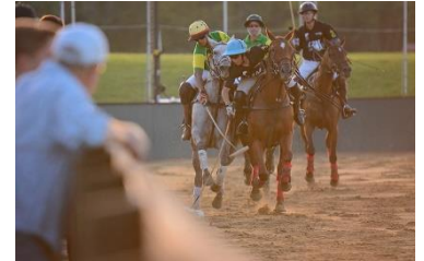
Polo at Morven Park

Get dressed to the nines or wear a comfy pair of jeans for Polo in the Park . Bring a chair or a picnic blanket and enjoy a night of Polo. Dinner tonight is from South Street Under , a local sandwich shop, known locally for its fresh baked ciabatta bread. Sip wine along with your meal and enjoy the fast-paced matches on a nice summer evening.