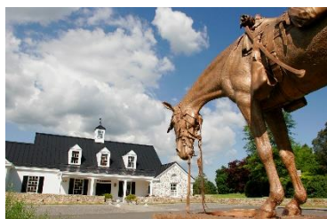
National Sporting Library

Start your morning at the National Sporting Library and Museum . Horsemanship, steeplechasing, foxhunting, polo, coaching, and more comes to life with a docent led tour through this unique museum. A visit to the rare-book room will showcase some of the items that make this museum such a hidden gem in Loudoun County.