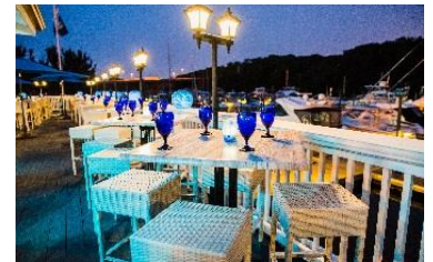
The Harbour Grille

Dinner tonight is on the water at The Harbour Grille or Madigan’s Waterfront . Both restaurants are located on the Occoquan River and feature a wonderful array of freshly prepared seafood and steaks, as well as other comfort food favorites. You’ll be able to see the boats float by, a fitting end to a day full of fun!