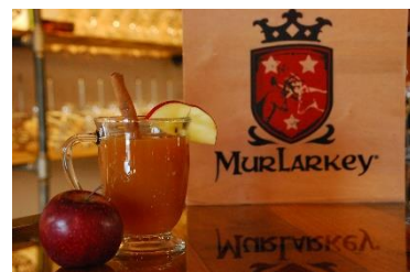
MurLarkey Distilled Spirits

How did most soldiers get through these harrowing times? By drinking whiskey! Your next stop is at MurLarkey Distilled Spirits , a craft spirits company founded by second generation Irish American cousins. Your experience will not be simply tasting their spirits but will also be a bartending lesson as their team creates miniature craft cocktails so you can get a real-world sense of how to serve their spirits at home.