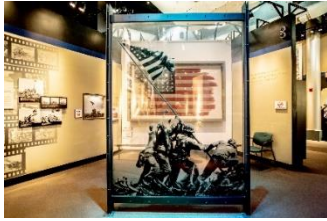
National Museum of the Marine Corps

Your next stop is an experience at the National Museum of the Marine Corps . Uncover the history of the Corps, test your skills as a Marine, and get insight into the lives of those who fight for our freedom. During your visit, see the incredible Gene Hackman-narrated film “We, The Marines” to get an unparalleled view into the experiences of Marines from boot camp through modern warfare training. Enjoy a quick lunch in the Devil Dog Diner, their cafeteria style eatery, or Tun Tavern, a recreation of the famous tavern in which the Marines were founded in Philadelphia over 240 years ago.