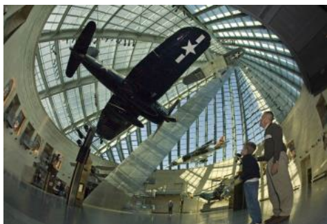
National Museum of the Marine Corps in Marine history.

Need ideas for your next mystery tour? Engage your group by visiting Prince William, Virginia! Travel back in history by visiting a charming small town, learn about previously forgotten veterans and the founding of the U.S. Marine Corps, and enjoy a blast from the past show with a modern twist!