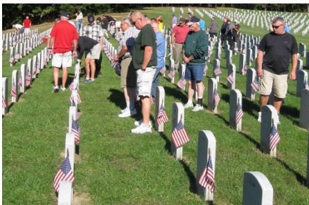
Quantico National Cemetery

If your group is adventurous, you may opt to go on a guided kayak or paddleboard tour of the Occoquan River .