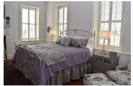
Inn at Evergreen

Tonight, your group will overnight at The Inn at Evergreen . Built in the 1800s, Evergreen played an important role during the Civil War and the Underground Railroad movement. This 11-room upscale inn is listed on the National Register of Historic Places, as well as the National Underground Railroad Network to Freedom. Your rooms may also overlook the 18 th hole of the adjacent private golf course!