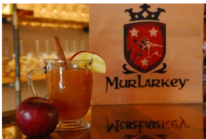
MurLarkey Distilled Spirits

Your next stop is Ben Lomond Historic Site for a VIP tour. Used as a hospital after the First Battle of Manassas/Bull Run during the Civil War, your tour will take in the sights, sounds, and smells of what it was like to be a wounded soldier in July 1861. You'll visit parts of the house that are not open to the general public and may include a cooking demonstration, musket firing demonstration, or other interactive experience.