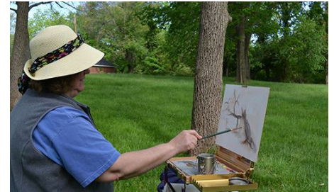
Plein Air Painting

Regroup back at the Inn at Evergreen before departing for home.