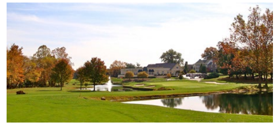
Evergreen Country Club