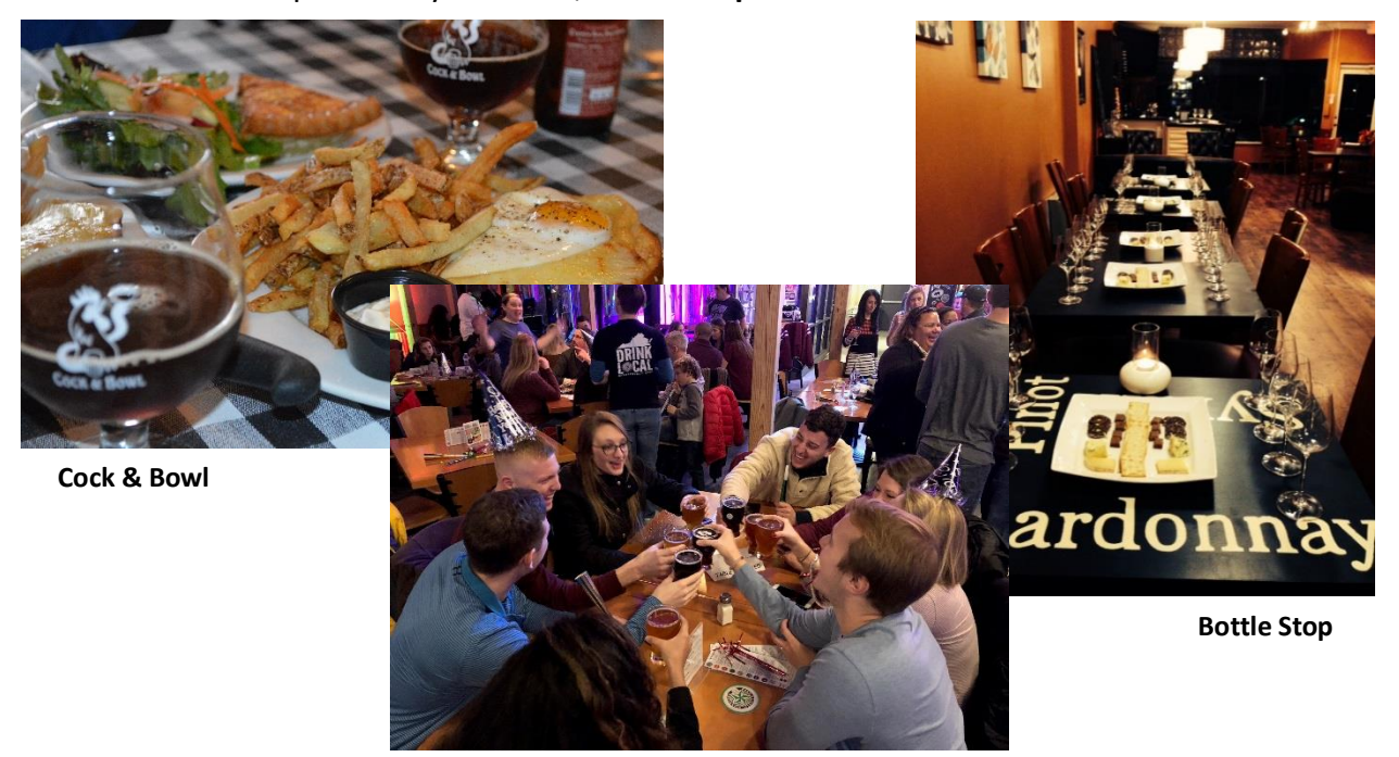
Brew Republic Bierwerks

End your day by traveling to Brew Republic where you'll discover the brewing process from start to finish. Get a behind the scenes look at their facility and taste their Great American Beer Festival award-winning beer. Alternatively, send your palate to Paris by way of Occoquan for French cuisine at Bistro L'Hermitage , sample Belgian fare and libations at Cock & Bowl , or unwind with a wine paired dinner at Occoquan's only wine bar, Bottle Stop .