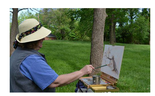
Plein Air Painting

Regroup back at the Inn at Evergreen before departing for home.