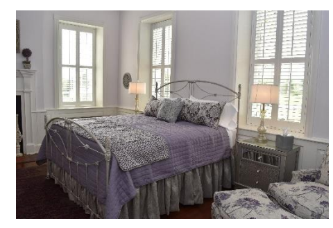
Inn at Evergreen