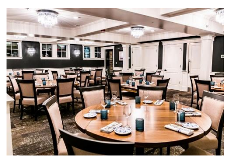
The Black Sheep

If you prefer your spirits distilled, jaunt over to MurLarkey Distilled Spirits for a private tour and tasting. Learn about the distilling process from grain to glass and sample this family-owned distillery's cocktail ready spirits. You could try their barrel aged dark whiskey called Brutality, all-natural gin titled Imagination, or the gluten-free vodka aptly named Divine Clarity.