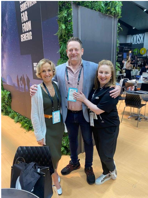
Catching up with key Australian clients