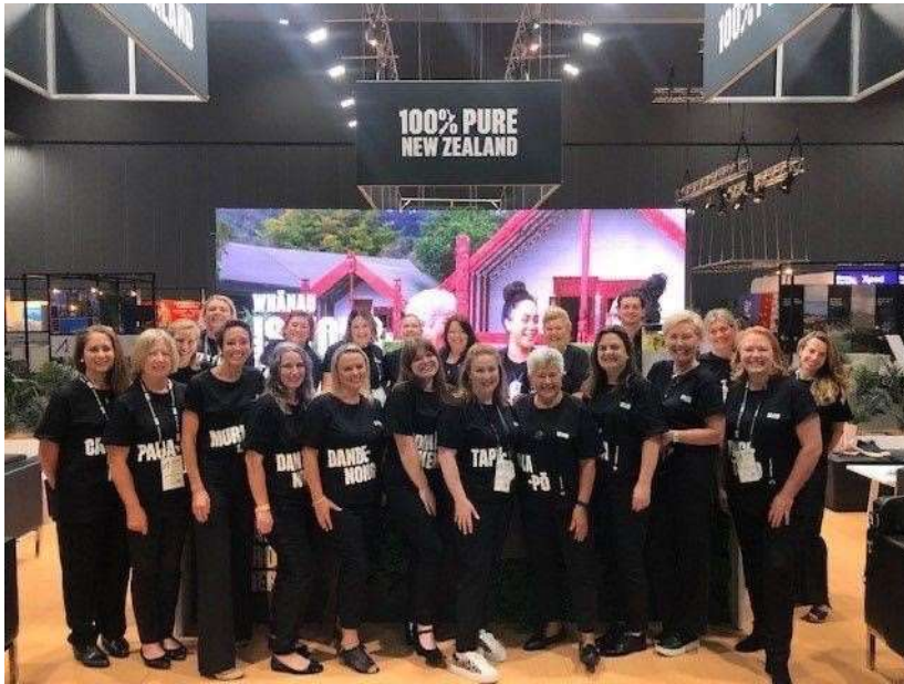
The whole NZ contingent