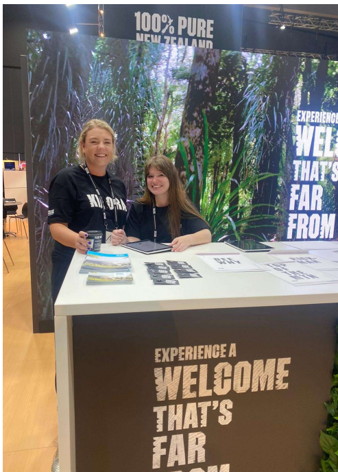
The NZ stand reception and pepeha creation area

Destination Queenstown PO Box 353, Queenstown 9348, New Zealand +64 3 441 0700