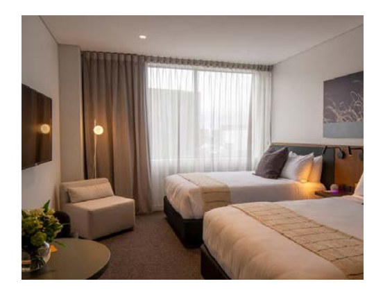
Location: Five Mile, Frankton