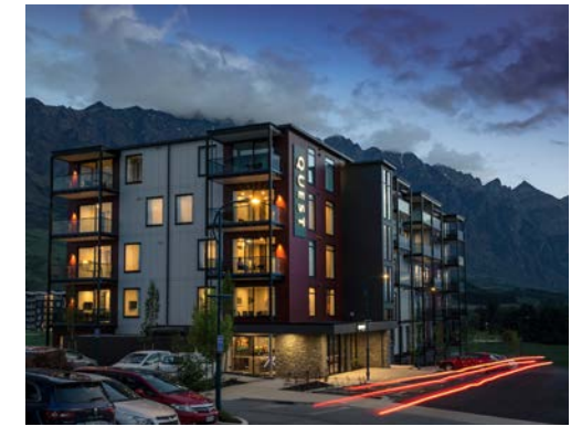
Location: Remarkables Park, Frankton