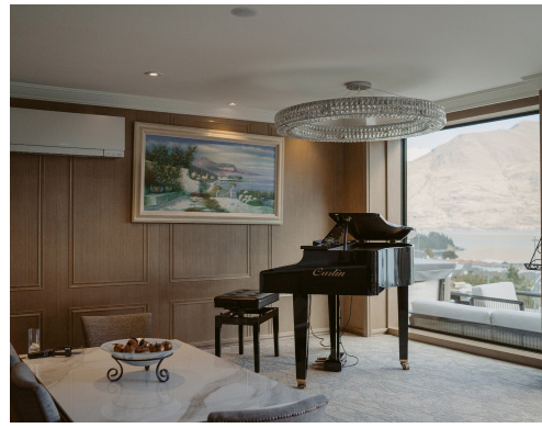
Location: 43 Hallenstein Street, central Queenstown