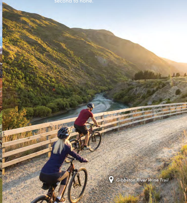
📍 Gibbston River Wine Trail

When you're not in the saddle, you're in the home of adventure, with delicious local food and wine to taste and an après-bike scene second to none.