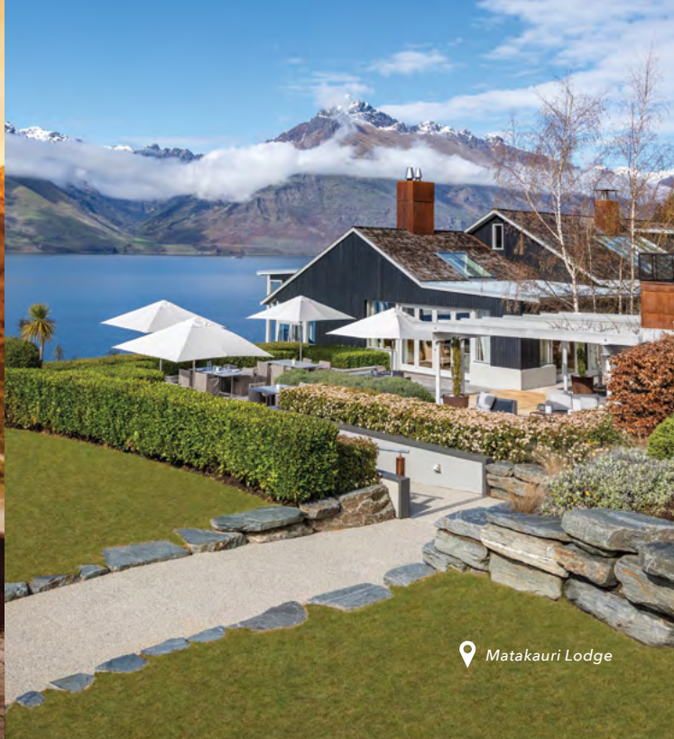
📍 Matakauri Lodge

Taste the best the region has to offer, as internationally renowned chefs pair exceptional ingredients with award-winning Central Otago wines. Take dining to the next level with a mountain top feast or alfresco picnic packed with local produce.