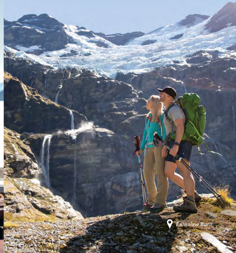
📍 Earnslaw Burn

Planning your Queenstown hiking adventure is easy with equipment hire, track transport, great accommodation, and guided walks. Climbing, biking, kayaking, and rafting all offer you more fun ways to explore the alpine landscapes.