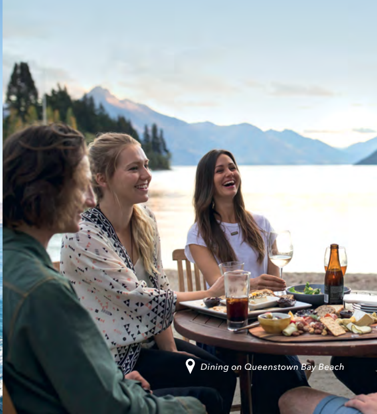
📍 Dining on Queenstown Bay Beach

Food adventures in Queenstown are spectacular in all seasons, and with a range of activities as diverse as the flavours you'll encounter, there are many ways to recover your appetite.