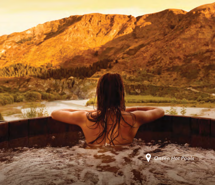
📍 Onsen Hot Pools

Once you're on Queenstown time, reconnect with nature and explore the stunning landscapes on an outdoor adventure. Immerse yourself in nature with 130kms of bike trails and a network of glorious hiking trails. Then rejuvenate from the inside exploring fresh, local produce that celebrates the best of Queenstown's food scene.