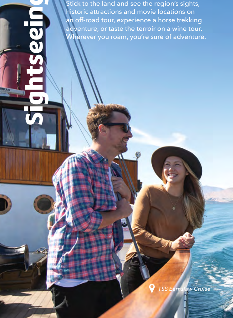
📍 TSS Earnslaw Cruise

Stick to the land and see the region's sights, historic attractions and movie locations on an off-road tour, experience a horse trekking adventure, or taste the terroir on a wine tour. Wherever you roam, you're sure of adventure.