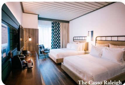
The Casso Raleigh

Located between the Glenwood South and Warehouse Districts in downtown Raleigh, this incredibly-stylish and modern full-service property opened in March 2021. The vibrant 126-room, seven-story boutique hotel with locally-inspired décor includes event space and a plant-forward restaurant called Good Day Good Night.