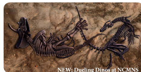
NEW: Dueling Dinos at NCMNS

Largest natural science museum in the Southeast with four floors of exhibits, live animals, 3D movies, gift stores and two cafes. The museum includes a Nature Research Center which is a mixture of a visitor destination, research hub and hands-on student laboratory.