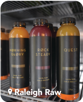
📍 Raleigh Raw