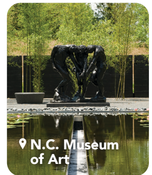
📍 N.C. Museum of Art