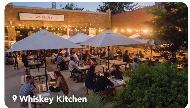
📍 Whiskey Kitchen