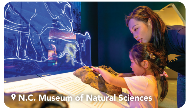
📍 N.C. Museum of Natural Sciences