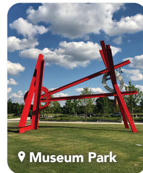
📍 Museum Park