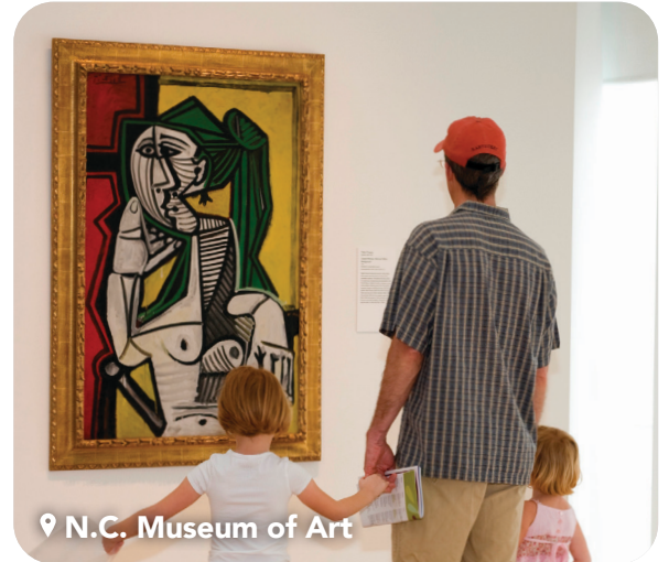
📍 N.C. Museum of Art