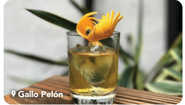
📍 Gallo Pelón