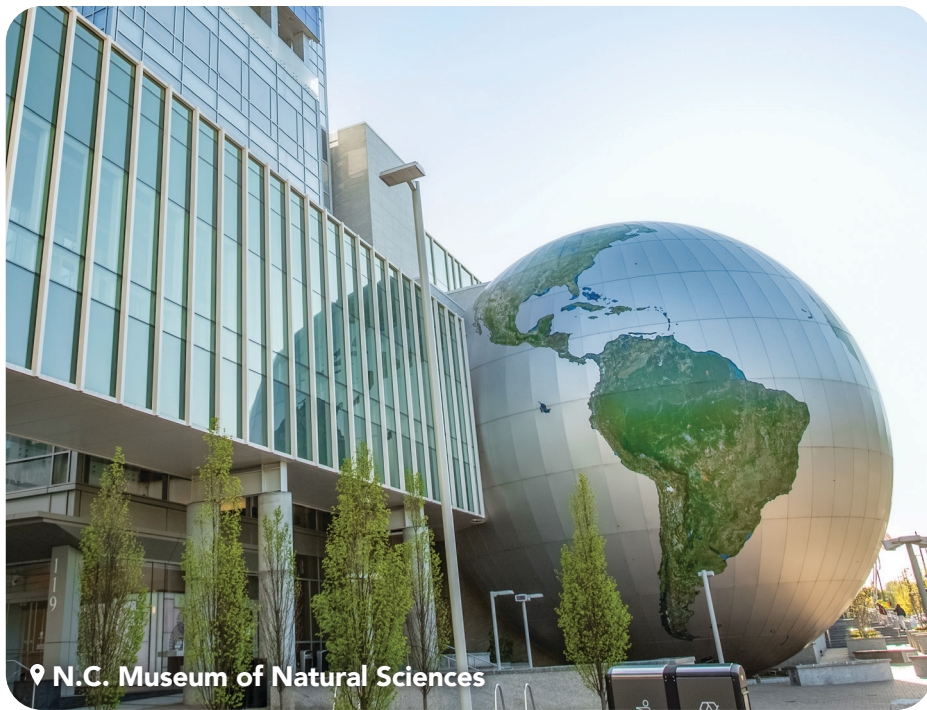
📍 N.C. Museum of Natural Sciences