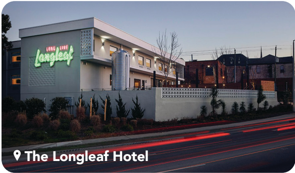
📍 The Longleaf Hotel