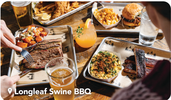
📍 Longleaf Swine BBQ