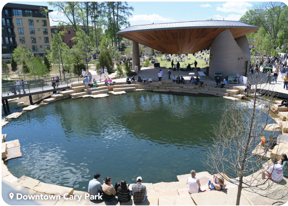
📍 Downtown Cary Park