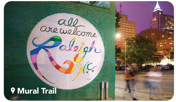
📍 Mural Trail