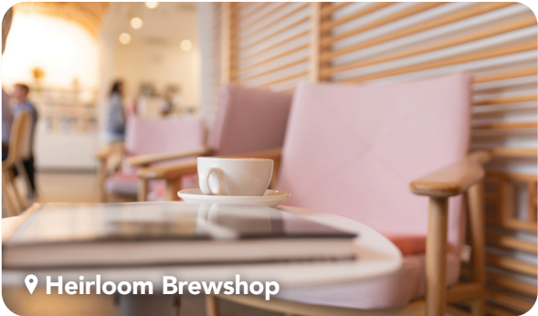
📍 Heirloom Brewshop