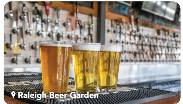
📍 Raleigh Beer Garden