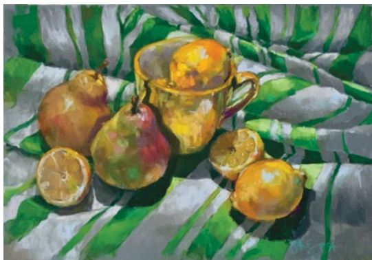
4 Jeri Greenberg, BlueJayWay, pastel, 12 x 16"