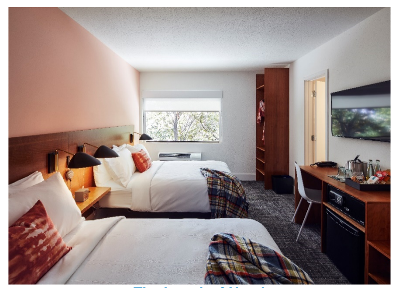
<u>The Longleaf Hotel</u>: (56-room vintage motor lodge)

A modernized mid-century gem sitting at the northern gateway into downtown Raleigh not far from the museums, State Capitol, Glenwood South district and more. The state's namesake is the soaring longleaf pine, which inspired every aspect of this modern renovation of a vintage motor lodge. The property has 56 rooms and includes the swanky Longleaf Lounge and patio, which is great for enjoying locally roasted coffee, classic cocktails or a local beer.