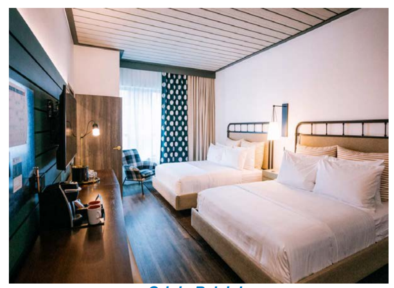
Origin Raleigh: (126-room, boutique hotel)

Located between the Glenwood South and Warehouse Districts in downtown Raleigh, this incredibly stylish and modern full-service property opened during the COVID-19 pandemic. The vibrant 126-room, seven-story boutique hotel with locally inspired décor includes event space and a plant-forward restaurant called <u>Good Day Good Night</u>.