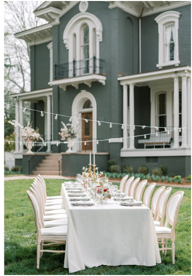
<u>Heights House Hotel</u> (formerly Montfort Hall): (9-room boutique inn)

A historic pre-Civil War-era mansion in downtown Raleigh has been completely renovated and revitalized into a boutique hotel. Named for its location within Raleigh's historic Boylan Heights neighborhood, the 10,000-square-foot, 1858 Italianate-style mansion features nine guest rooms that have been lovingly restored, 15-foot ceilings and original hardwood floors throughout the space, a total of 10 cozy fireplaces and grand common spaces crafted with immaculate detail and decorated with modern and vintage touches. This National Historic Landmark opened in May 2021.