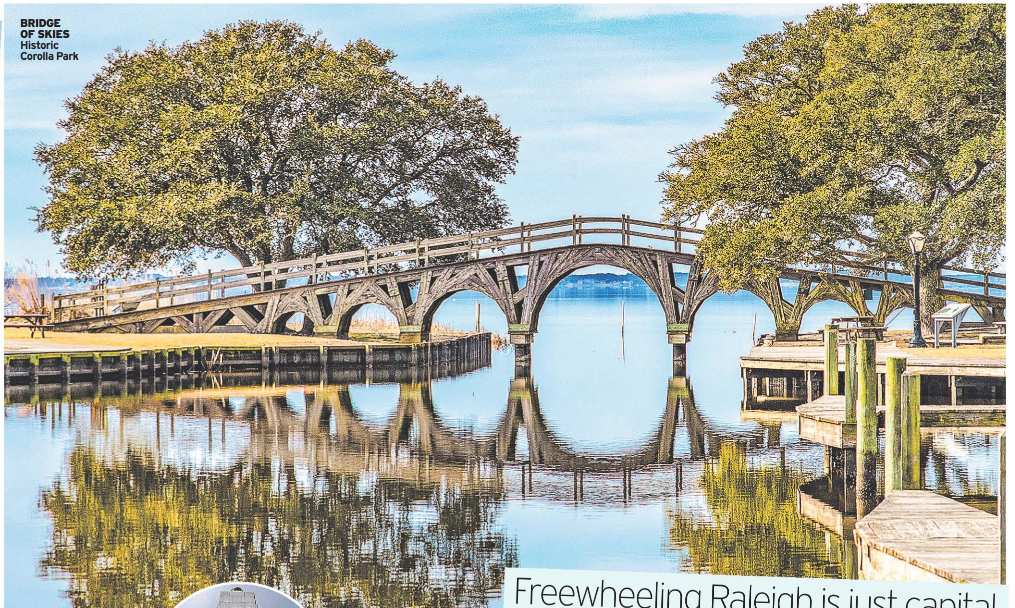
BRIDGE OF SKIES Historic Corolla Park

minutes after we passed directly over the flight monument. For only $69 it was a memorable way to see the Outer Banks on a beautiful sunny day.