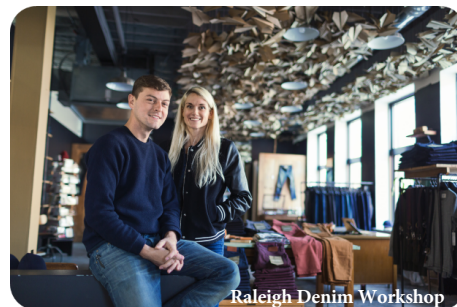
Raleigh Denim Workshop