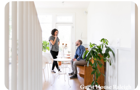
Guest House Raleigh