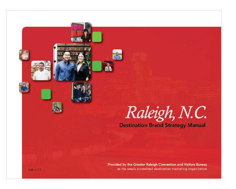
This Raleigh, N.C., Destination Brand Strategy Manual is one of a three-part series of Raleigh, N.C., Destination Brand Guides.