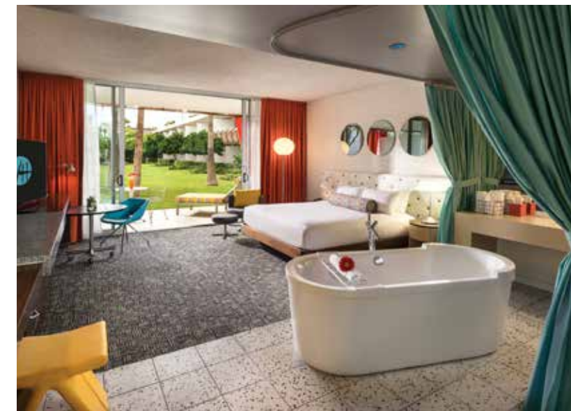
A studio guest room at Hotel Valley Ho in Scottsdale