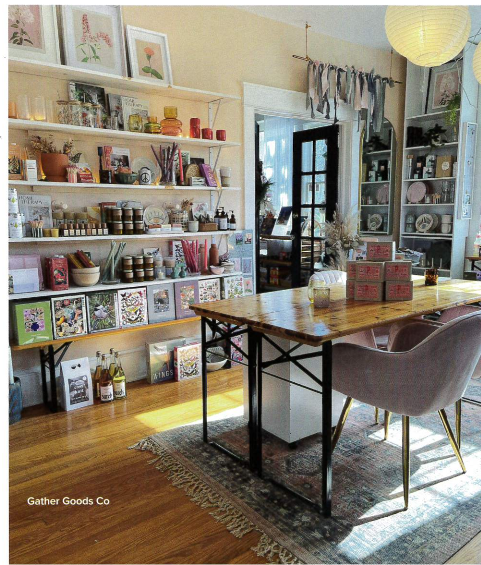
Gather Goods Co

The Cary Vintage Market occurs monthly with clothing, jewelry, and accessories on offer—but also records, cassettes, and housewares, along with food trucks, specialty baked goods, and beverage options for shoppers. Claire Nobles says she founded the market based on her penchant for classic vintage style that spans several decades. The result is that the market appeals to customers of all ages who are drawn to its multiple facets. @caryvintagemarket