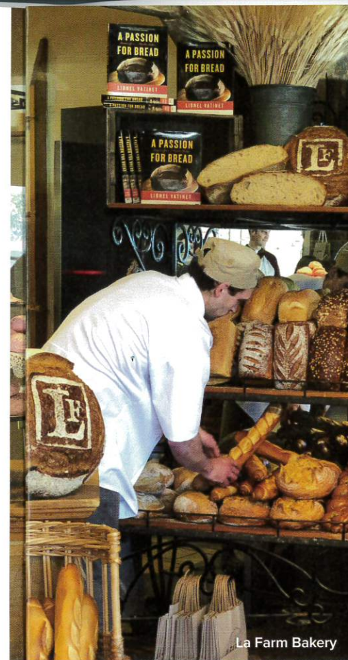
La Farm Bakery