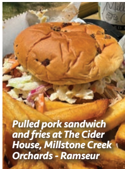
Pulled pork sandwich and fries at The Cider House, Millstone Creek Orchards - Ramseur