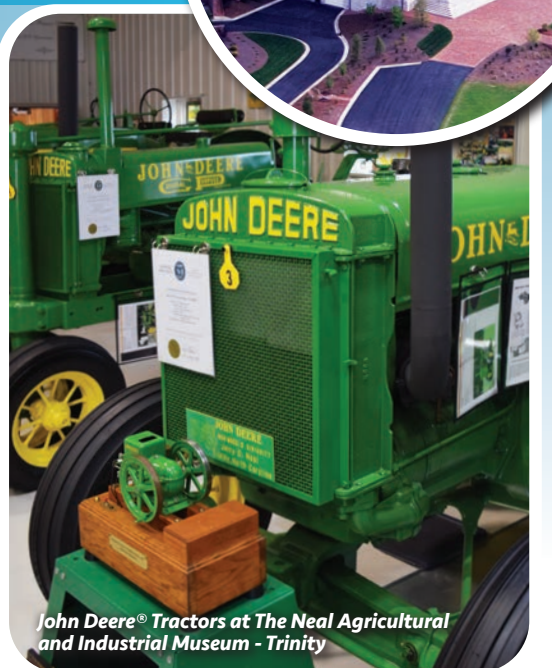
John Deere® Tractors at The Neel Agricultural and Industrial Museum - Trinity