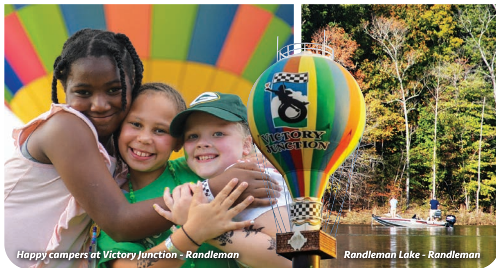
Happy campers at Victory Junction - Randleman