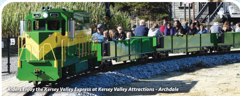
Riders Enjoy the Kersey Valley Express at Kersey Valley Attractions - Archdale