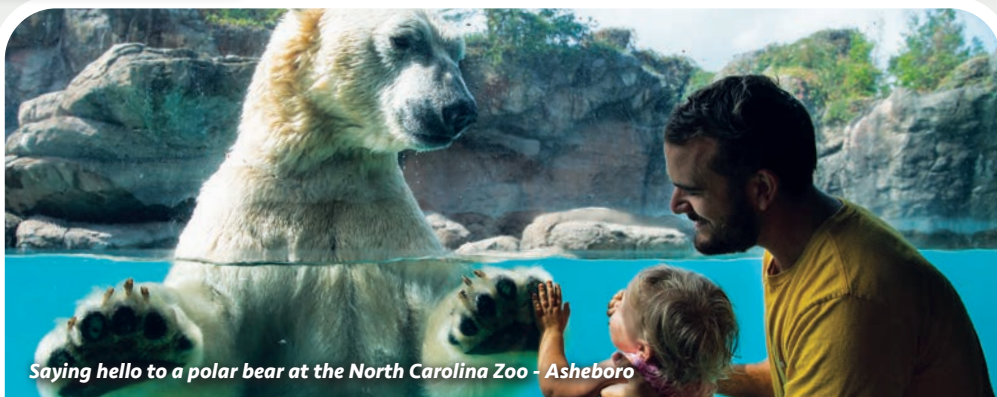
Saying hello to a polar bear at the North Carolina Zoo - Asheboro