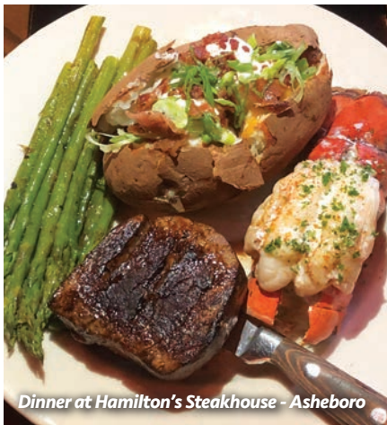
Dinner at Hamilton's Steakhouse - Asheboro