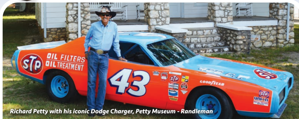
Richard Petty with his iconic Dodge Charger, Petty Museum - Randleman