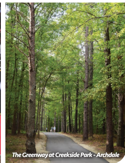
The Greenway at Creekside Park - Archdale