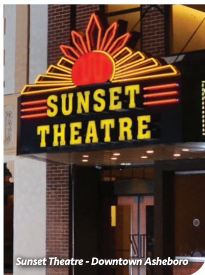
Sunset Theatre - Downtown Asheboro