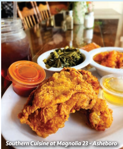
Southern Cuisine at Magnolia 23 - Asheboro