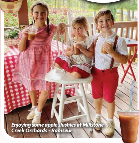
Enjoying some apple slushies at Millstone Creek Orchards - Ramseur