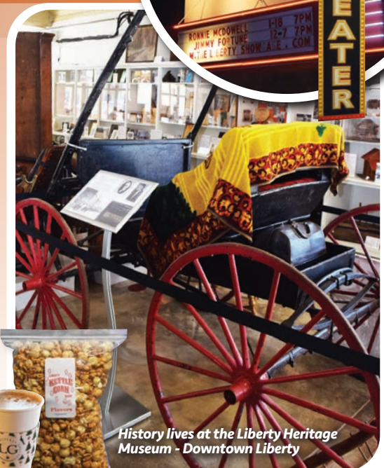
History lives at the Liberty Heritage Museum - Downtown Liberty