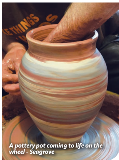
A pottery pot coming to life on the wheel - Seagrove