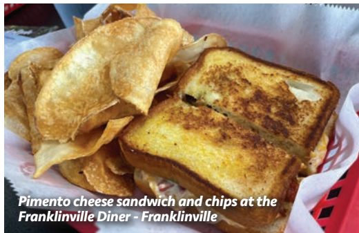
Pimento cheese sandwich and chips at the Franklinville Diner - Franklinville