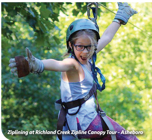
Ziplining at Richland Creek Zipline Canopy Tour - Asheboro