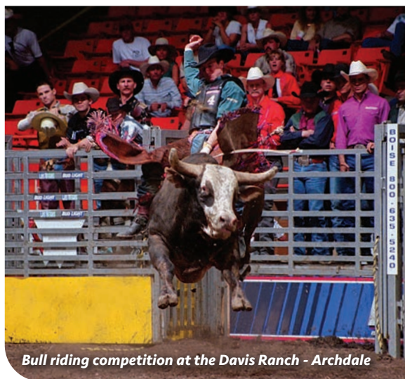
Bull riding competition at the Davis Ranch - Archdale