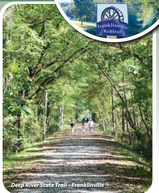
Deep River State Trail - Franklinville