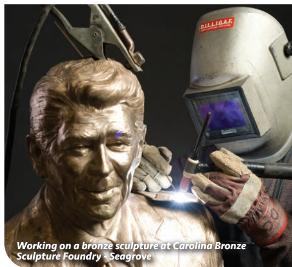
Working on a bronze sculpture at Carolina Bronze Sculpture Foundry - Seagrove