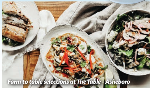
Farm to table selections at The Table - Asheboro