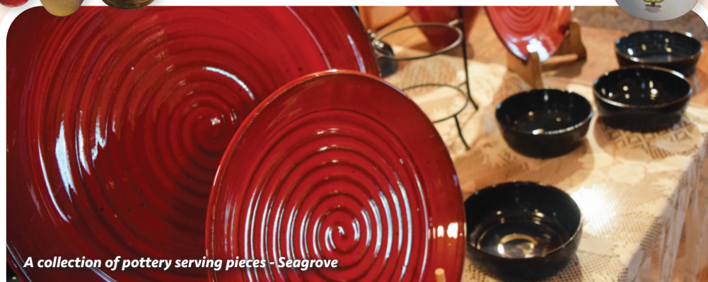
A collection of pottery serving pieces - Seagrove