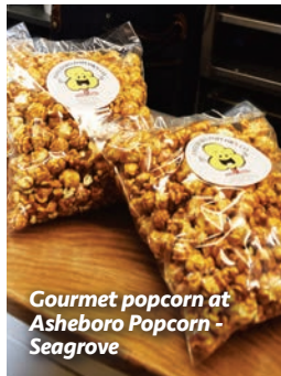
Gourmet popcorn at Asheboro Popcorn - Seagrove