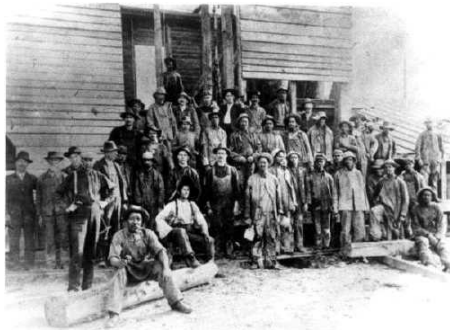
Gold Miners - Early 1800s