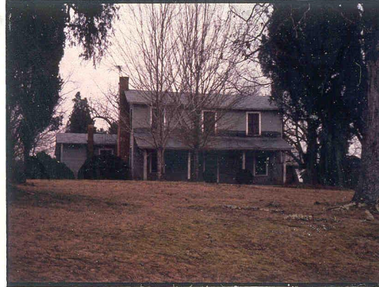
National Register Thornburg Farmstead

All trails within the Wilderness are designated hiking trails, and are blazed in white paint. Travel by horse, motorized vehicles, or bicycles are prohibited. A detailed map of the Wilderness is available at the District Ranger's Office.