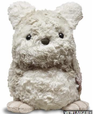
Purrble

This is far from the company's first award -- another product was selected to "50 Best Innovations of 2018" by Time Magazine.