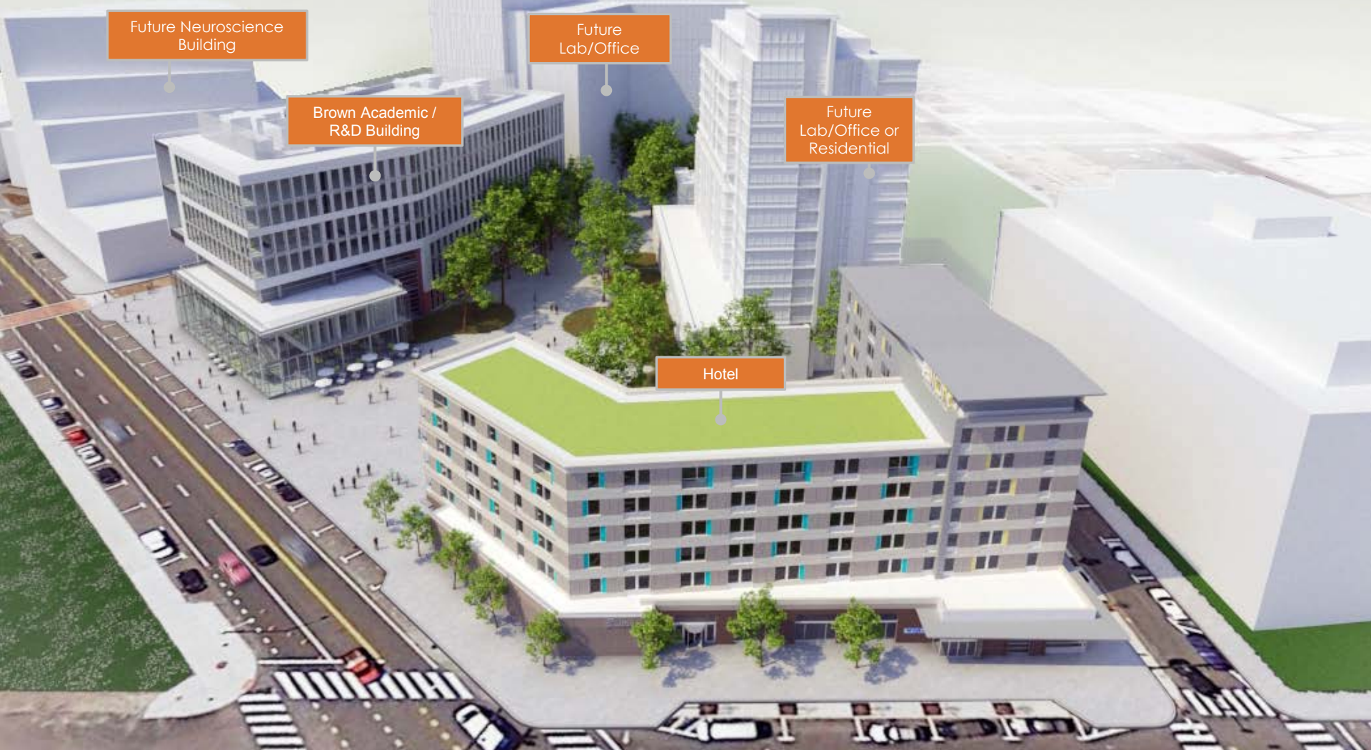
Rendering: Parcel 22 & 25