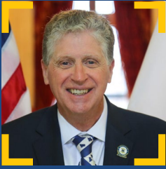
The Honorable Daniel J. McKee First meeting as Governor was March 2021 Chair, Governor, State of RI