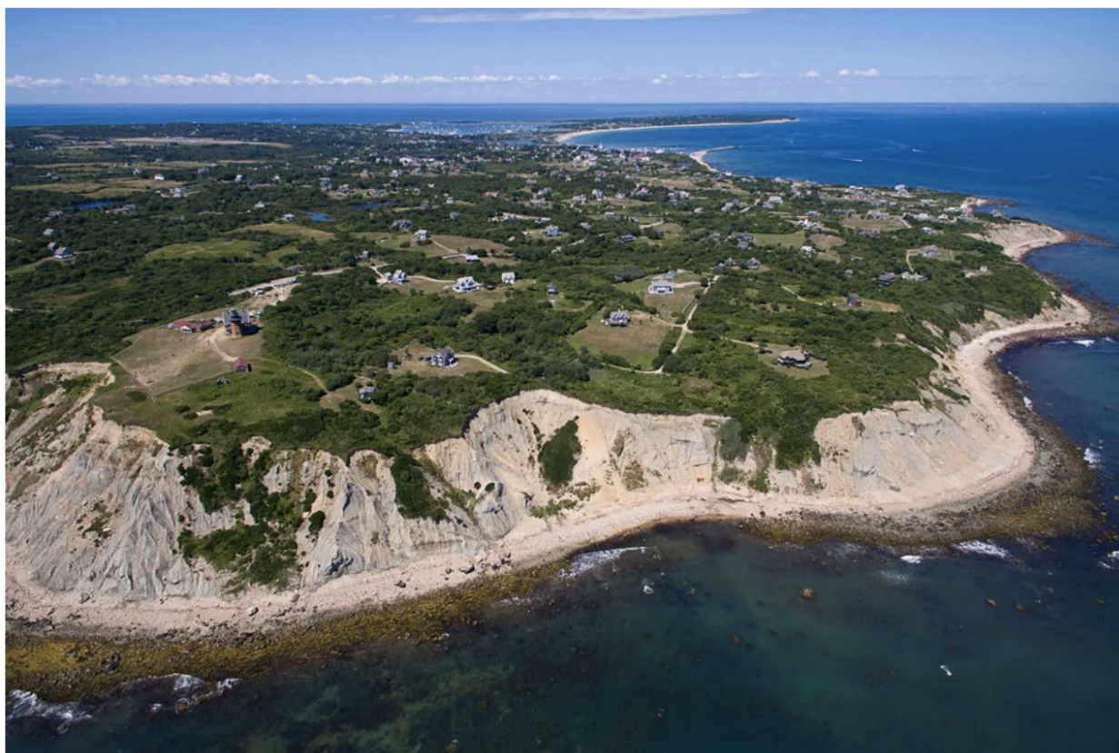
Mohegan Bluffs

Block Island is a nautical paradise with 17 miles of sandy beach, hundreds of freshwater ponds and water so blue that you might think you're in the Caribbean. With over 250 bird species landing here annually, it's an avian wonderland. A web of walkways connects miles of unspoiled habitat with stunning vistas. Ponder the immensity of Mohegan Bluffs and hike rolling trails at Rodman's Hollow.