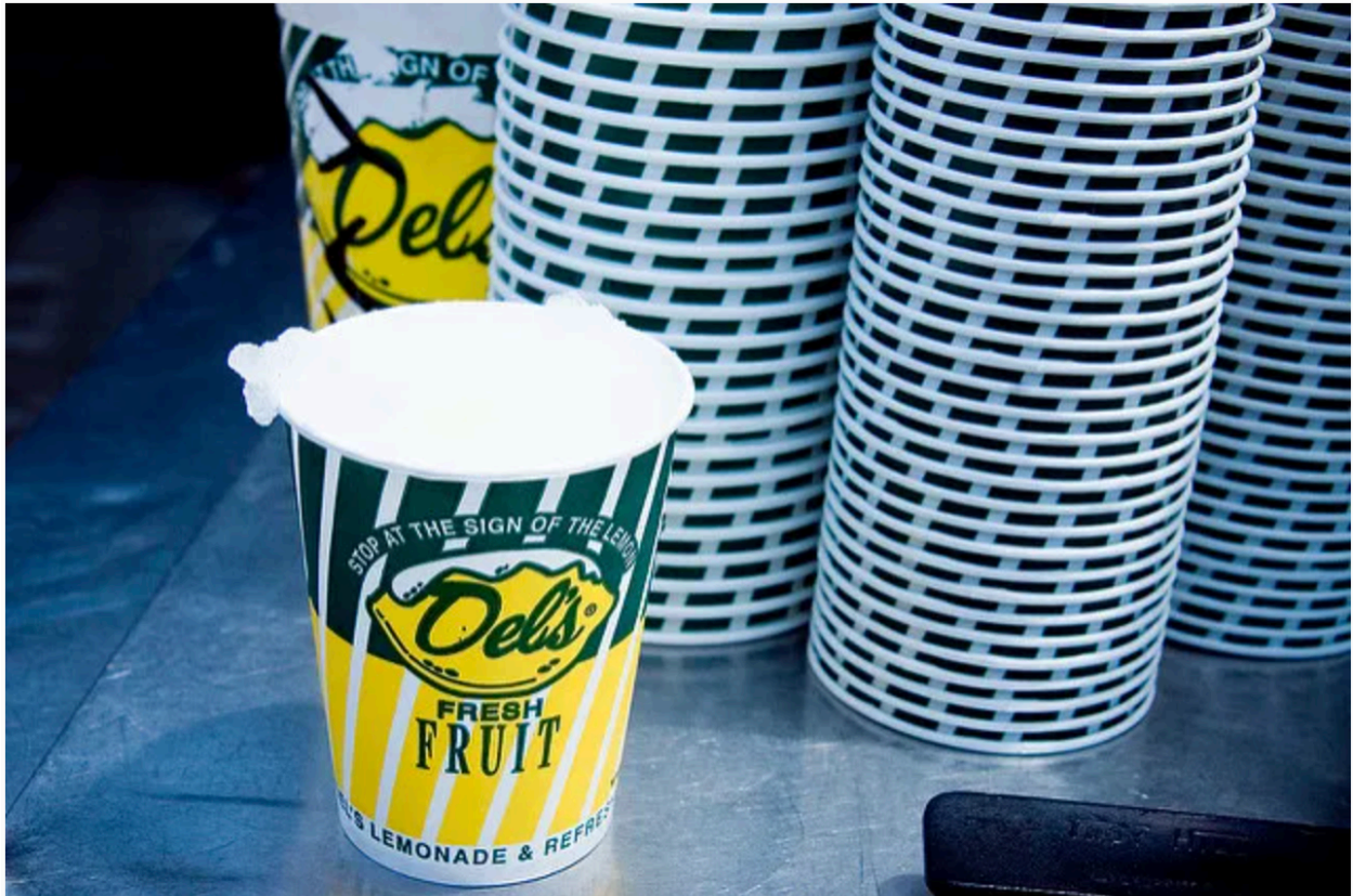
MAY 21, 2020 – Rhode Island favorite Del's Lemonade.

Online peeks at cities and destinations are not uncommon now. But Providence has added some oomph to it. You can, from your home, tour art galleries, visit amazing street art (and learn all about it at the same time), take in some theater, visit the zoo animals and even — get this — go to a drag brunch, all online. Here's a way to "experience Providence" now so you're ready to zip right down there and truly know how to experience the great city in person, the moment that's a good idea.