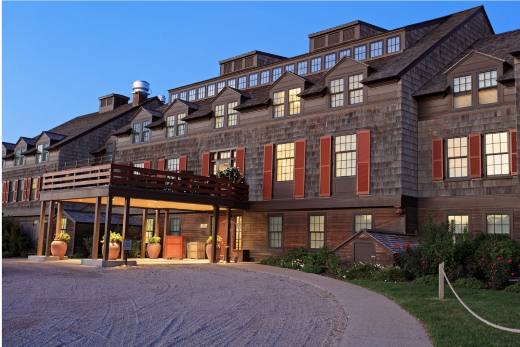
The Weekapaug Inn in Westerly, Rhode Island will put you seaside in a cozy setting and makes for a perfect winter escape.