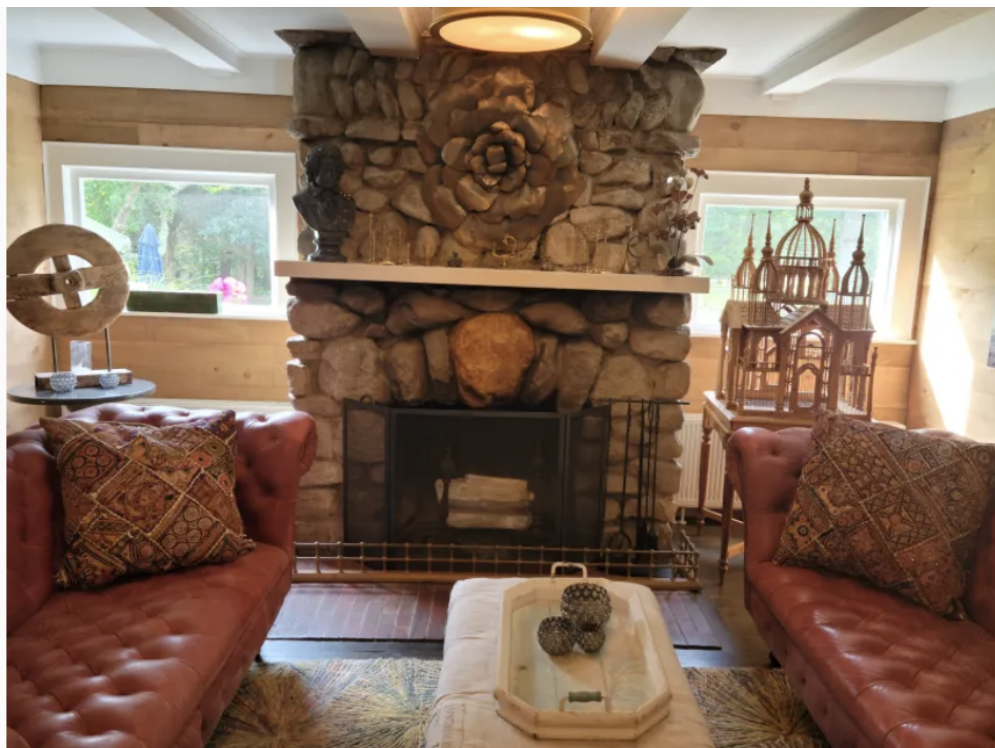
Cozy up to the fireplace in the living room of the Shelter Harbor Inn.

The dining there is great too — and you have usage rights to the nearby Ocean House as well.