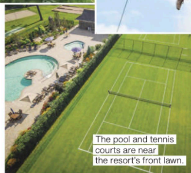
The pool and tennis courts are near the resort's front lawn.

Additional wedding events can include Maker's Mark tasting experiences in the adorable Hobbit Houses or scotch-and-cigar tastings in safari-style tents. After-reception add-ons include fireside s'more making and slider and pizza stations (wedding packages start at $225 per person and include one-hour cocktail reception with hors d'oeuvres, two-course dinner, wine service, wedding cake, and four-hour open bar for up to 75 guests, plus a venue charge. Ceremony site and set-ups are $3,750; preservesportingclub.com). ■