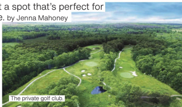
The private golf club.

The property, which encompasses a variety of wedding-perfect accommodations from tiny homes and oversized multi-room suites to spacious log-cabin-like luxury cabins, boasts an endless activity menu. Popular offerings include guided hiking and a rock climbing wall,