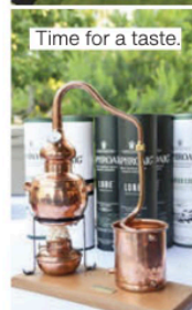
Time for a taste.

The Vanderbilt, Auberge Collection Wed at a bonafide mansion of the Gilded Age. Positioned within walking distance to downtown Newport, it's perfect for brides who want to explore the area with their guests.