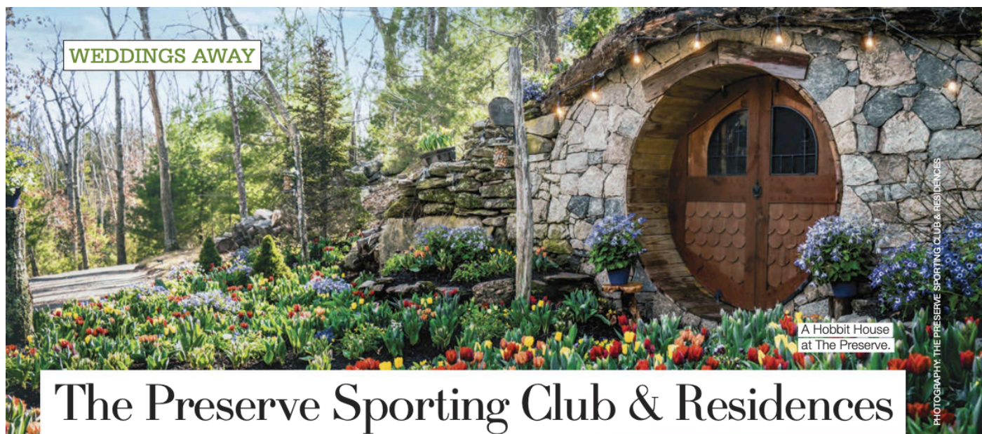
A Hobbit House at The Preserve.