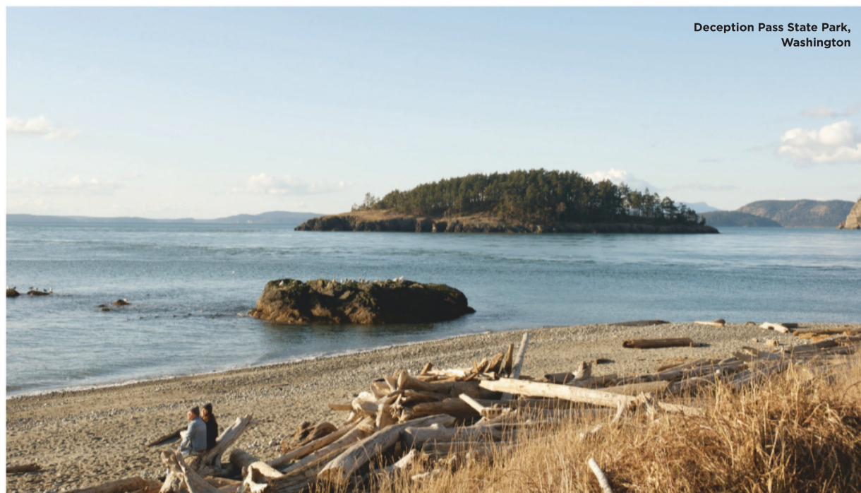
Deception Pass State Park, Washington

In the spectacular Apostle Islands National Lakeshore in Lake Superior, this remarkable beach on remote Stockton Island has sands that are not only beautiful but musical. Known as "singing sands," a quality found in 10 to 20% of the world's beaches, Julian Bay's sand actually emits a magical, singing sound.