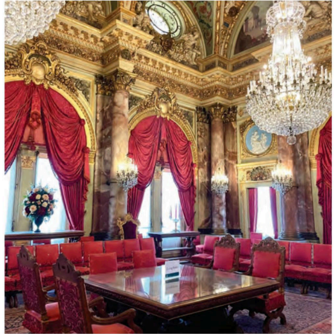
The breathtaking rooms inside the Vanderbilt family's summer mansion The Breakers include the dining room, anchored by its two large Baccarat crystal chandeliers. The mansion may be recognizable to fans of the HBO/MAX television show, "The Gilded Age," since some rooms at The Breakers were used as settings.

What to do: Fly to capital city Providence (a little over two hours from Atlanta's airport), itself scenic and charming. This home to Brown University and the Rhode Island School of Design (RISD) has a bustling riverfront area, vibrant murals and a strong culinary scene. Check into one of the chic downtown hotels: The Beatrice, modern and sophisticated with a special rooftop bar for