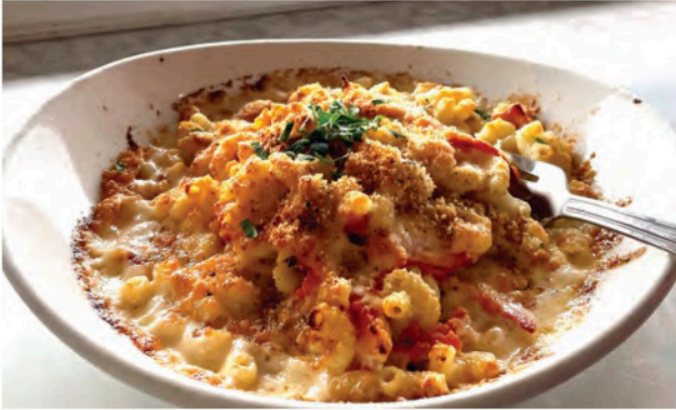
Lobster mac-n-cheese can be enjoyed seaside at the Old Coast Guard House, an historic and popular eatery in Narragansett.