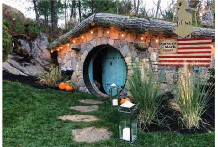
Hobbit houses in Rhode Island? Believe it or not, an enclave of adorable hobbit houses — available for events or photo shoots — are at The Preserve, an upscale sporting resort on the west side of Rhode Island. The little homes are even sanctioned by the Tolkien estate to use the name Hobbit.