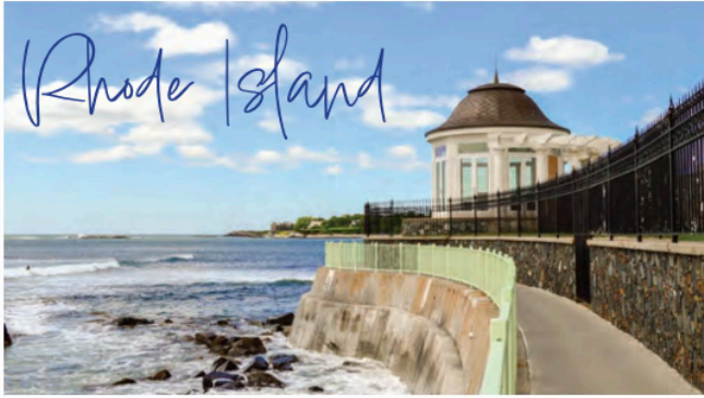
Newport's famed Cliff Walk is a 3.5-mile path that winds between the ocean and the town's Gilded Age mansions.