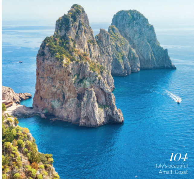
104 Italy's beautiful Amalfi Coast

A once-in-a-lifetime trip to the Great Barrier Reef