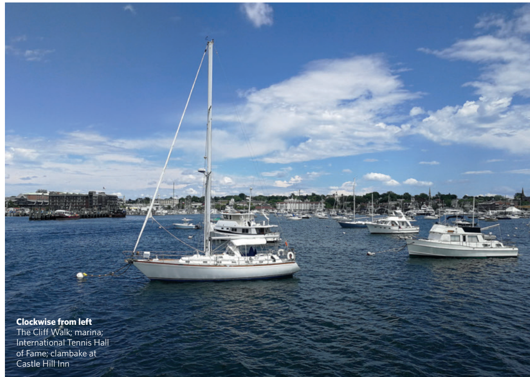
Clockwise from left The Cliff Walk; marina; International Tennis Hall of Fame; clambake at Castle Hill Inn