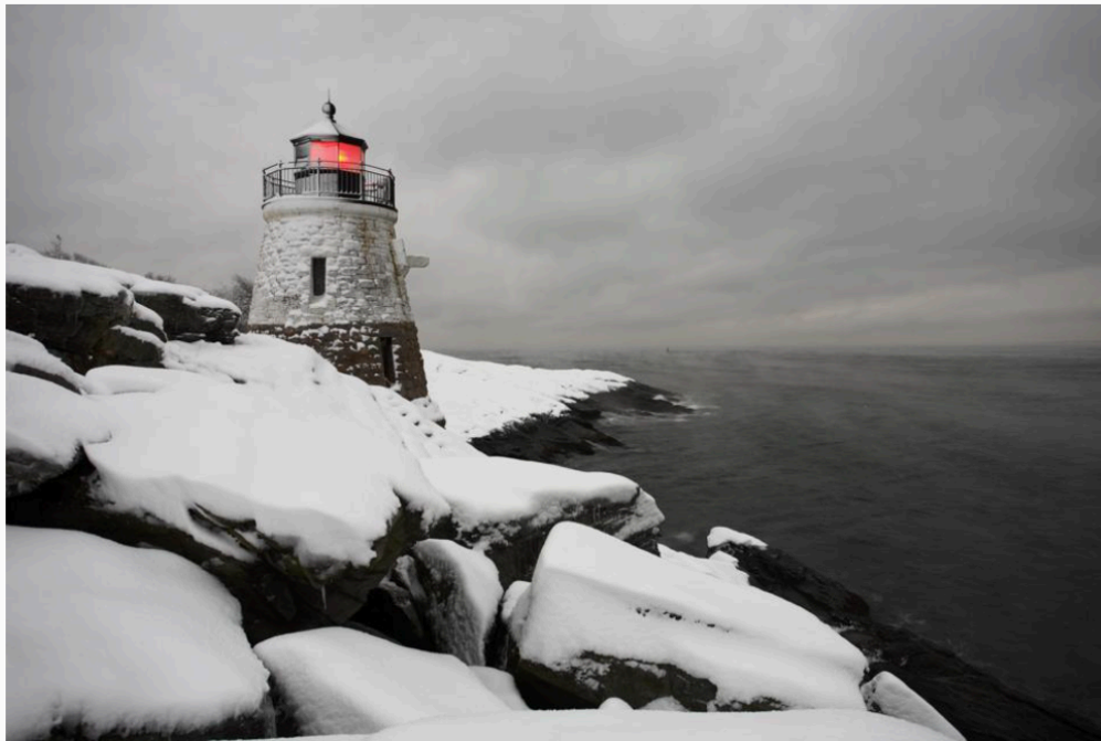
Castle Hill Lighthouse, Newport, Rhode Island, just after a snowstorm. Mist upon the water.

Newport Mansions announces “Sparkling Lights at The Breakers: An Outdoor Magical Wonderland.” The new outdoor experience will illuminate the mansion and its historic grounds through Sunday, Jan. 10, 2021.