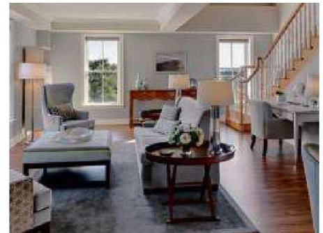
The East Turret Suite at Wentworth by the Sea.

311 GIFFORD STREET; 508-548-2300; THECOONAMESSETT.COM. JANUARY WEEKEND RATES FROM $298 FOR TWO NIGHTS (25 PERCENT BELOW FALL FOLIAGE SEASON).