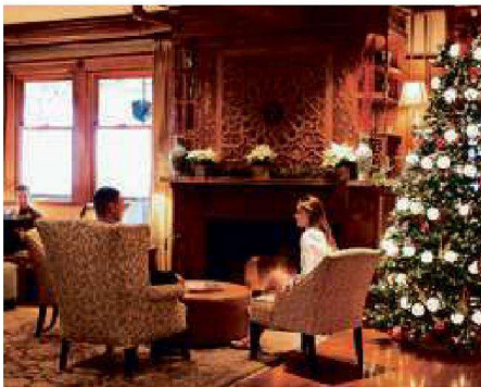
The lobby of Castle Hill Inn decked out for the holidays.

590 OCEAN DRIVE; 401-849-3800; CASTLEHILLINN.COM. LATE JANUARY WEEKEND RATES FROM $465 (ABOUT 25 PERCENT BELOW FALL FOLIAGE SEASON).