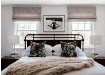
Top and above: Suites at The Coonamessett.