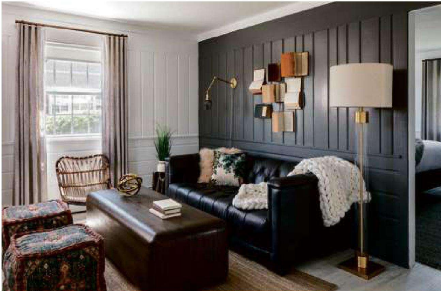
Dog Days / THE COONAMESSETT, FALMOUTH

W ITH SUNSET AROUND 4:30 P.M. in the middle of January, you and your pooch (more on that in a moment) can savor the light show over Buzzards Bay from Old Silver Beach and still have a whole evening ahead. Once you return to The Coonamessett, warm up with a hot toddy or a mug of spiced cider at the bar. You'll probably have plenty of company. The Coonamessett has been a regular hangout for year-round Cape Codders since 1953. And it hasn't missed a beat since becoming part of the Lark Hotels chain last May. The locals still descend on Eli's Tavern for drinks at the bar, romantic dinners, and special-occasion celebrations.