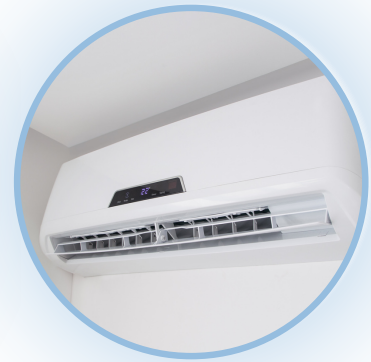
Ductless indoor wall unit

A combination of ducted and ductless systems may be suitable for some businesses. Heat pump technology provides lots of flexibility to mix and match indoor unit types to meet your needs. Using the right kind of indoor equipment can optimize comfort, control, and energy efficiency. Ask your contractor what they recommend based on the layout and heating/cooling needs of your business.