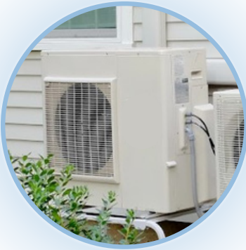
ASHPs have an outdoor compressor that should always be raised above the ground to keep the internal fan above snow.

One outdoor unit can be connected to multiple indoor units. There are many configurations of indoor units available, including ductless and ducted equipment that distribute heating and cooling throughout a building.