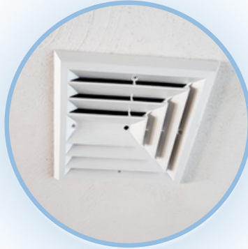
Ducted heating and cooling vent