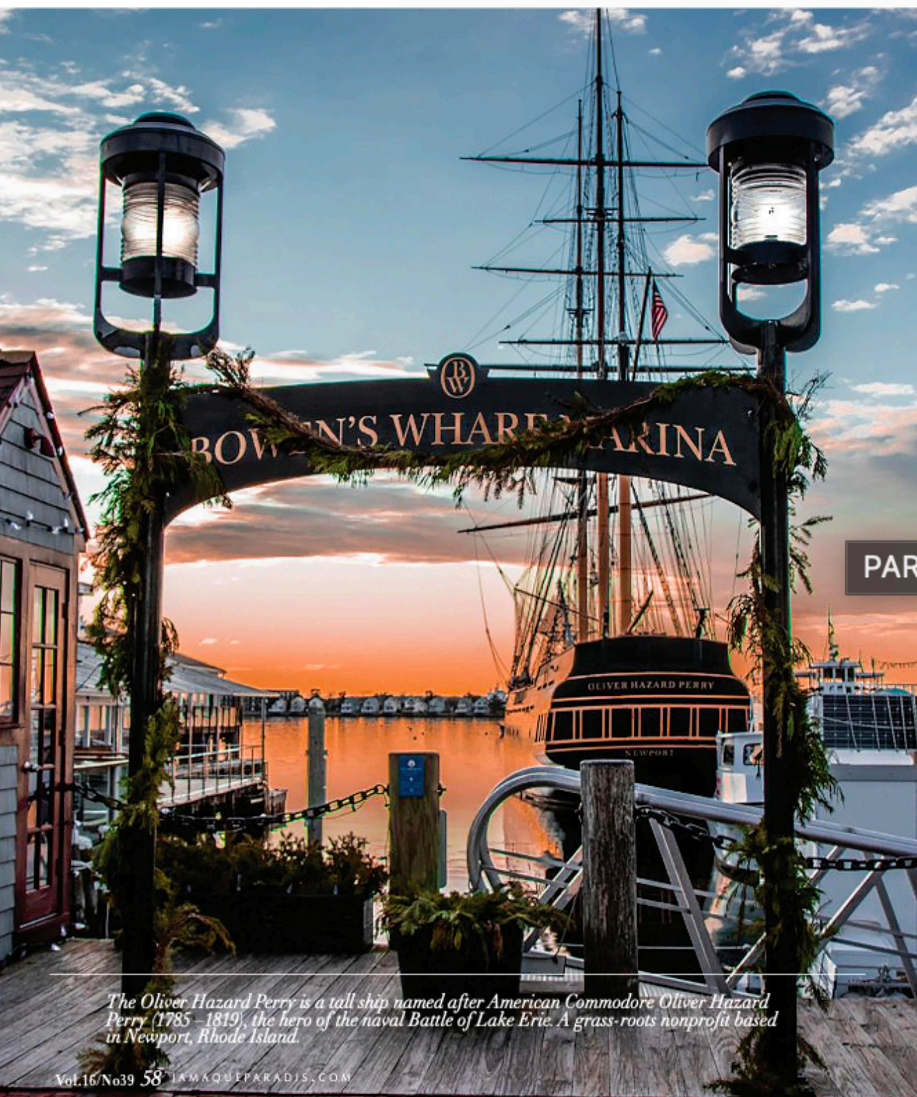
The Oliver Hazard Perry is a tall ship named after American Commodore Oliver Hazard Perry (1785–1819), the hero of the naval Battle of Lake Erie. A grass-roots nonprofit based in Newport, Rhode Island.