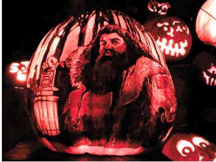
Hagrid, the nice giant of Harry Potter.

Some pumpkins are so beautiful that we say that the design had to be done by laser or stencil, but no. All pumpkins are hand-crafted and sculpted by artists at Passion for Pumpkins, a multimedia company in Oxford, Mass., which produces shows across the country.